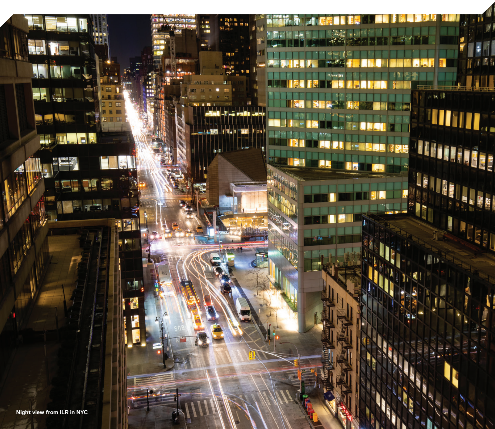
Night view from ILR in NYC