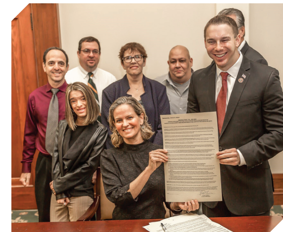
Nassau County residents, some of them directly impacted by Lafazan-led legislation to facilitate communication between Nassau police and deaf and hard of hearing motorists, celebrated the law’s passage.