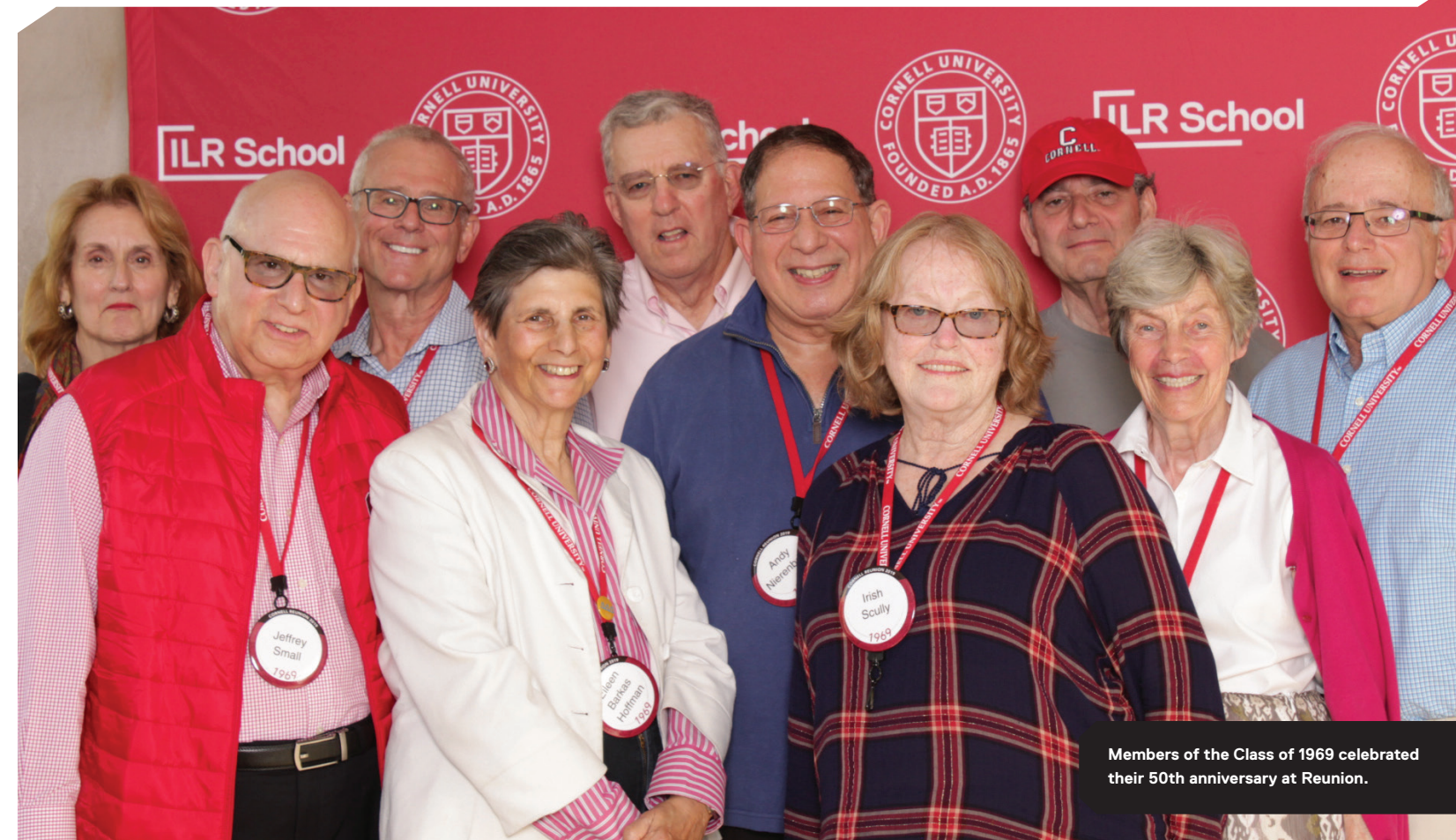
Members of the Class of 1969 celebrated their 50th anniversary at Reunion.

OCT 4-5 Cornell Homecoming APRIL 23 Groat and Alpern Awards JUNE 4-7 Reunion Weekend